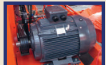
Electric Motor (ME Operation)