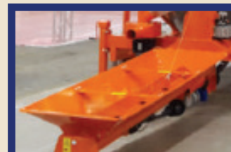
Loading Hopper 800x2,400mm for AGD Series