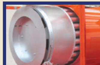
1. Heat Exchanger (Indirect Flame) 2. Dual Function Heat Exchanger (Direct - Indirect)