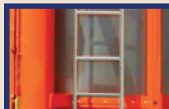
Inspection Ladder in Aluminium (without Protection Rings)

Call us today on +44 (0)1404 890300 to speak to us about our Mobile Driers.