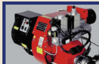
Dual Fuel Diesel / Gas or LPG Burner