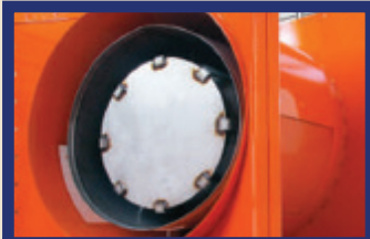
Combustion Chamber (Direct Flame)