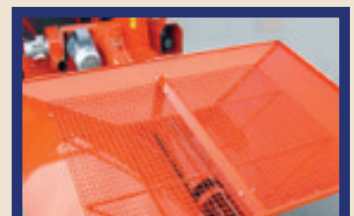
Loading Hopper 2,400x1,500mm for PRT200-250