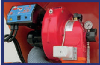
Diesel / Biodiesel Burner