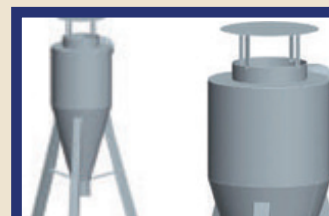
Dual Decanter Cyclone